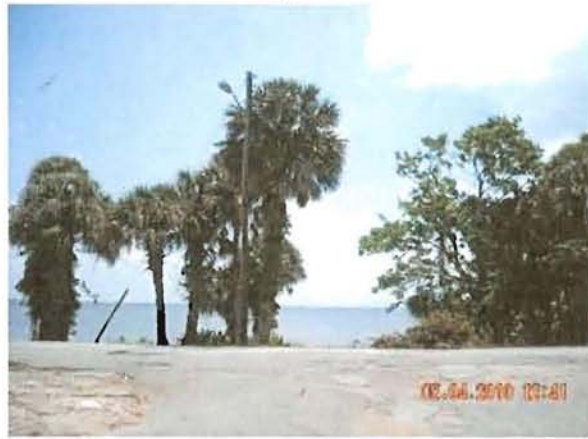
One Block to River