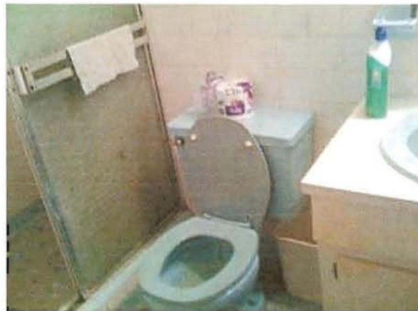
One of the Apt Bathrooms