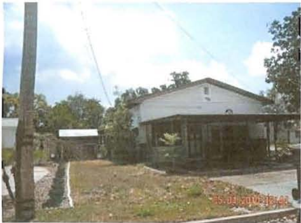
Double Car Port