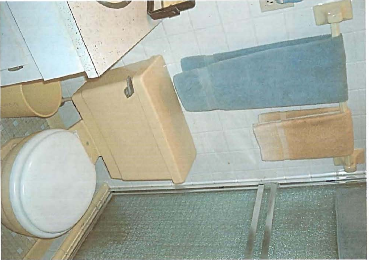
APARTMENT (B) BATHROOM