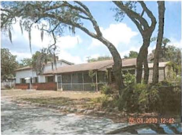
18 Brevard St